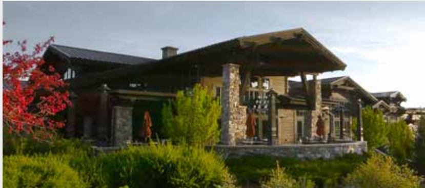
Your New Base Camp : Frost Creek's Clubhouse and Restaurant