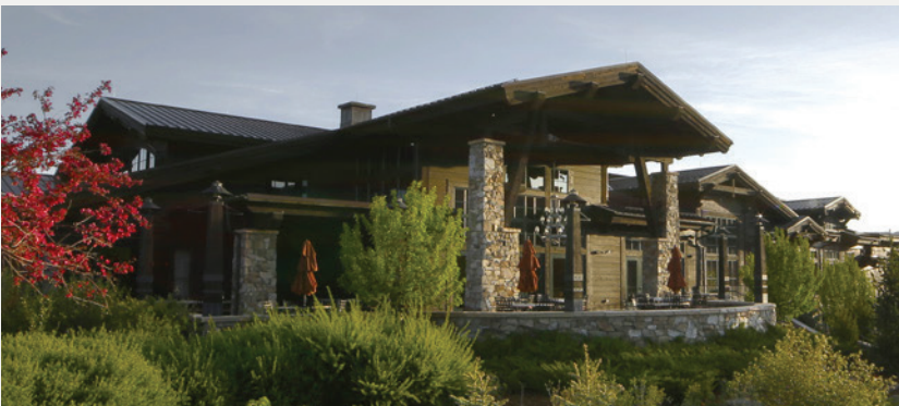
Your New Base Camp : Frost Creek's Clubhouse and Restaurant

Nestled in Eagle, CO's prestigious Hunters View community at Frost Creek, this meticulously designed Roosevelt model home features 4 bedrooms, 3.5 bathrooms, and multiple custom upscale features.